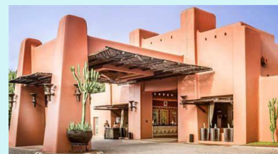
Conference Venue: Avani Victoria Falls Resort